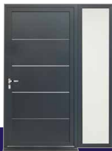
WESTMINSTER RHS SIDES