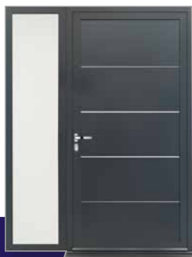
WESTMINSTER LHS SIDES