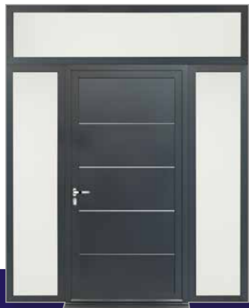
WESTMINSTER L+R+T SIDES

Overall a truly versatile addition to compliment the broadest range of bespoke Aluminium Doors.